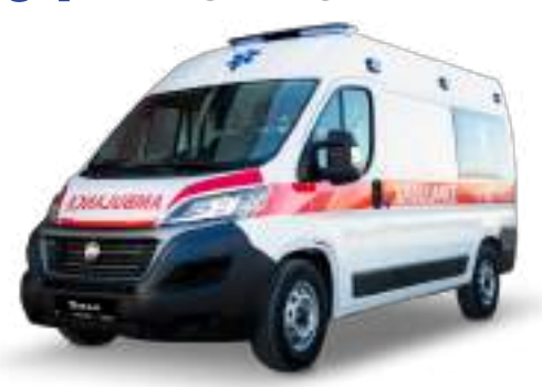
03 TRANSPORT AMBULANCE