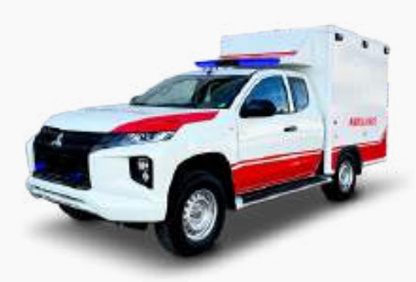
09 MINIVAN AMBULANCE