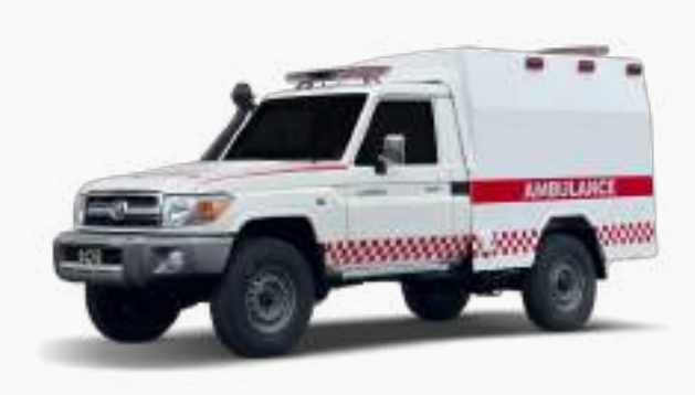
10 SUV 4X4 AMBULANCE