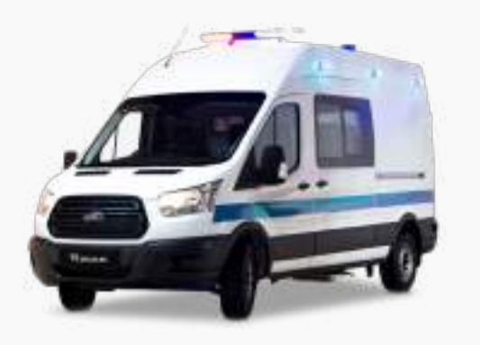
05 PRISONER AMBULANCE