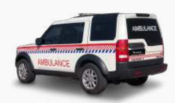
10 SUV 4X4 AMBULANCE