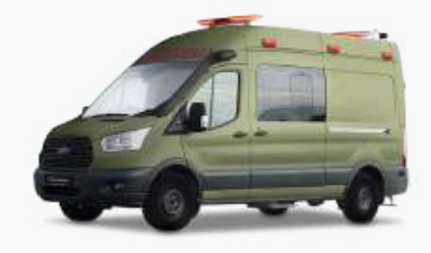
08 ARMORED AMBULANCE